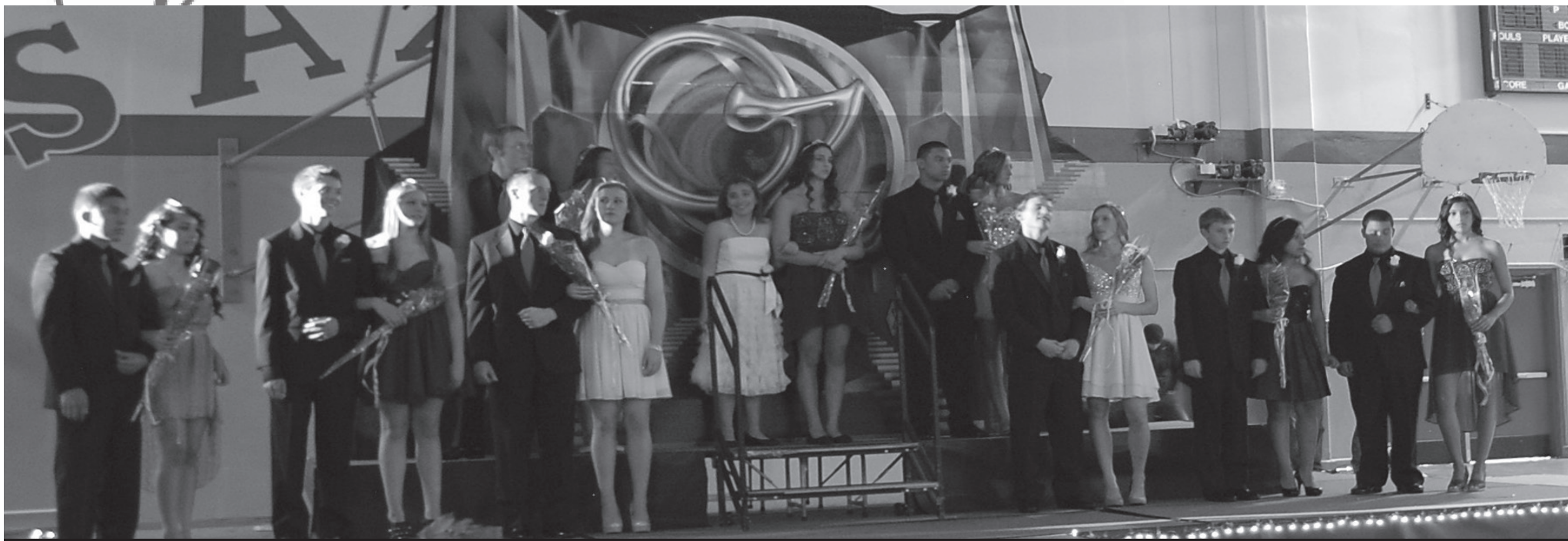
Homecoming court during the homecoming assembly on Oct., 26, 2012. For additional homecoming photos, scan the QR code below with your smart phone or visit clypian.com

Feature: Top 10 scary movies Opinion: Trick-or-Scary? -- How Old Is Too Old to Trick-or-Treat? Sports: Homecoming game highlights