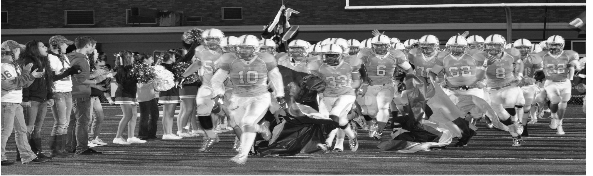
Guido Caldarazzo Stadium during the Soiuht verses North homecoming game Friday, Oct., 26, 2012.