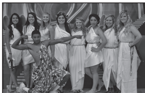
Seniors sport their togas Friday, Oct., 26 during spirit week.