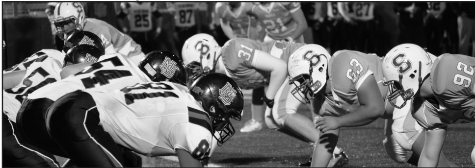
First play of the home coming game on Friday, Oct., 26, 2012 verses North.