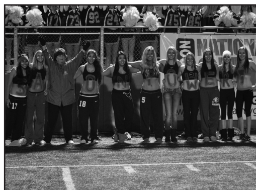
Saxon's show school spirit during the homecoming game on Oct., 27.

Scan this with your smart phone for access to more picture of the game, assembly and dance.